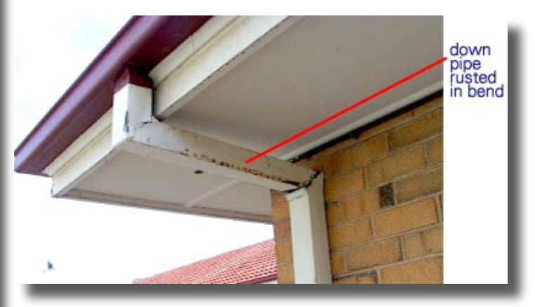
photo we see weeds in the gutter. This has led to rusting from the inside of the gutter. This is the result of many years of neglect. This gutter section will need replacing.

In the above photo we see rust in the downpipe serving the gutter above. This is caused by leaf and other waste laying in the pipe over years.