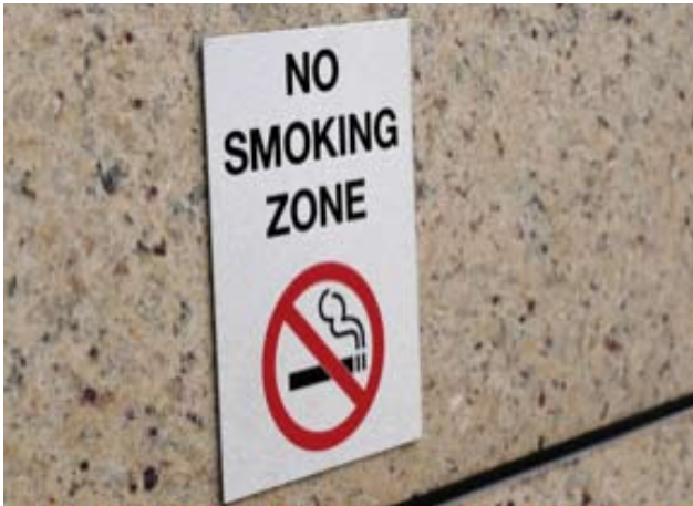
The use of clear signage will encourage compliance with smoke-free policies