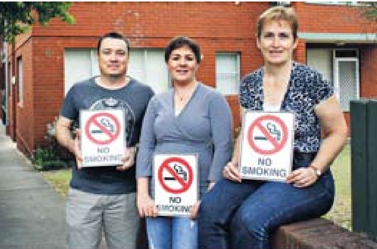
Ashfield residents happy with their smoke-free block.

The chairman sought advice from the block's strata manager about the legality of a strata by-law that would allow a 100% smokefree policy to be implemented at the block. Based on a 2006 decision by the Consumer, Trader and Tenancy Tribunal in NSW 44 , the strata manager confirmed the legality of such a by-law. Consequently, at the request of the owners' corporation, the strata manager developed a by-law, which was supported by more than the required 75% of those attending the special meeting organised to decide the matter.