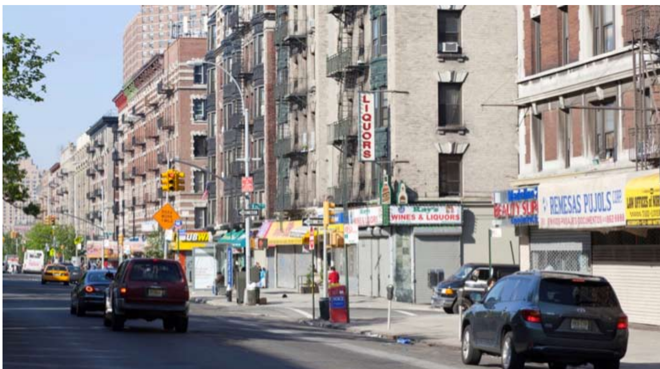
During the decade 2000-2010 the numbers of smoke-free apartment blocks in the US grew rapidly

Canadian websites suggest that smokefree policies in that country are also increasingly prevalent. For example, 50 multi-unit housing complexes have advertised their clean-air status on the website Smoke-free Housing BC. 67