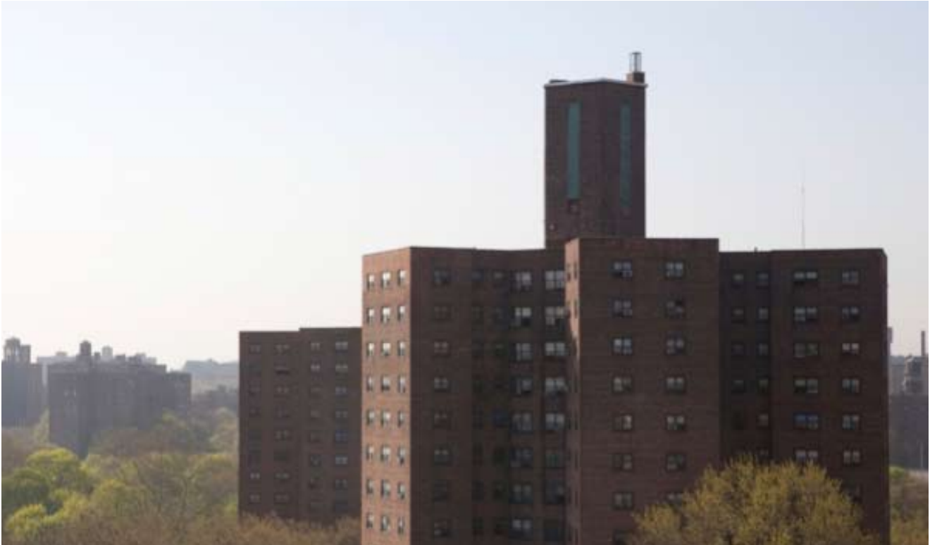
As of January 2011 at least 230 US local public housing authorities had adopted smokefree policies for some or all of their apartment buildings.