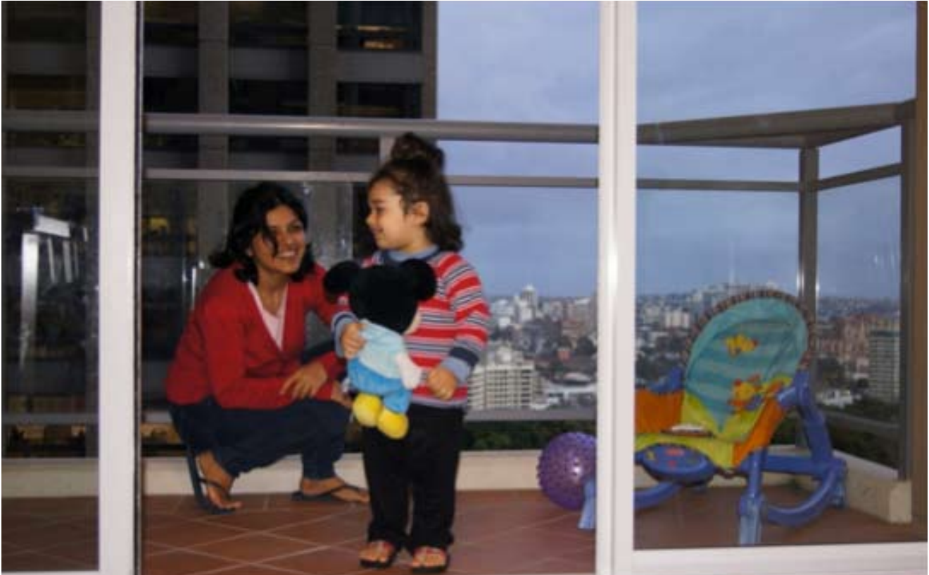
Children may be at risk from secondhand smoke drifting from nearby balconies

“second-hand smoke kills” and “causes cancer in non-smokers”. 7